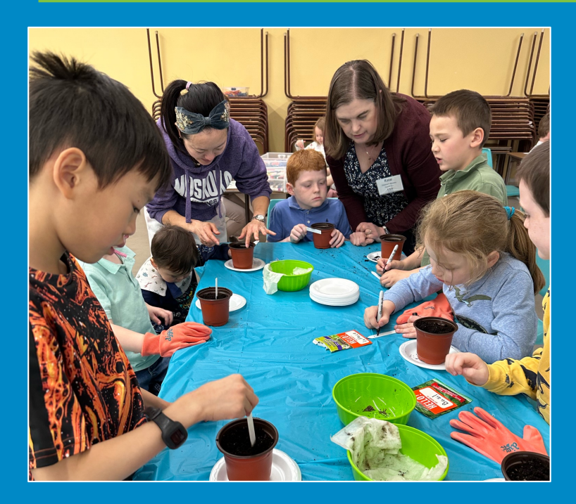
We must never underestimate the power of planting a seed!